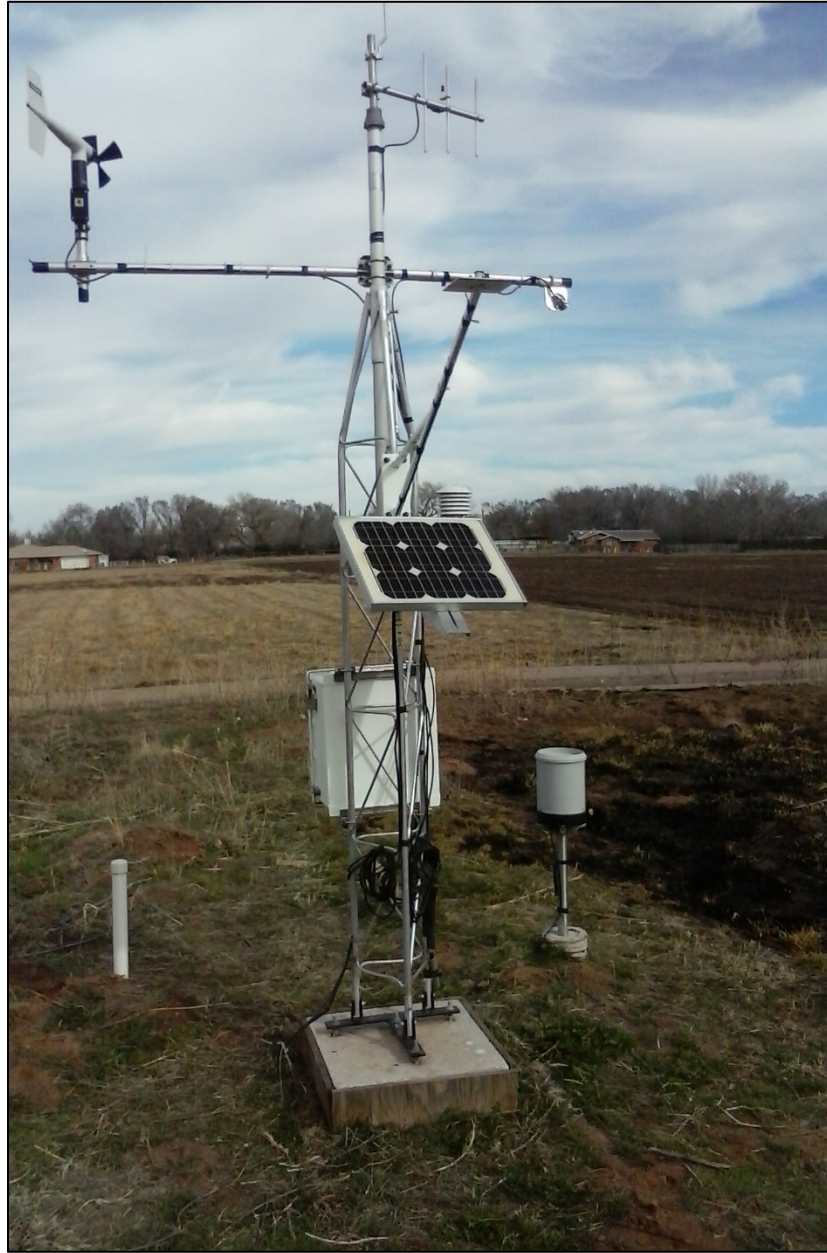
Figure 6. Gherardi Weather Station