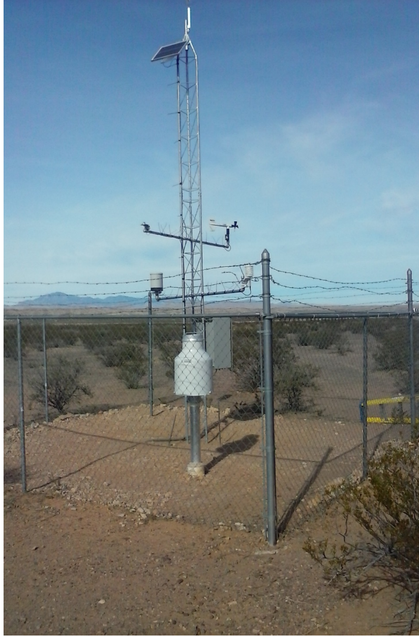
Figure 4. North Lake Weather Station