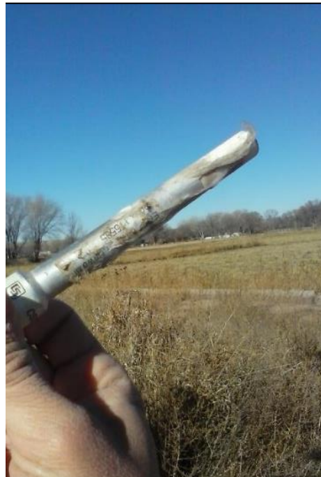
Figure 11. Left: Chew marks on sensor cable. Right: Spider webs on humidity and temperature sensor.