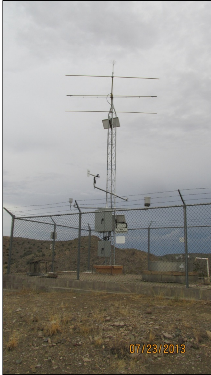
Figure 3. Slake Weather Station at Elephant Butte Dam