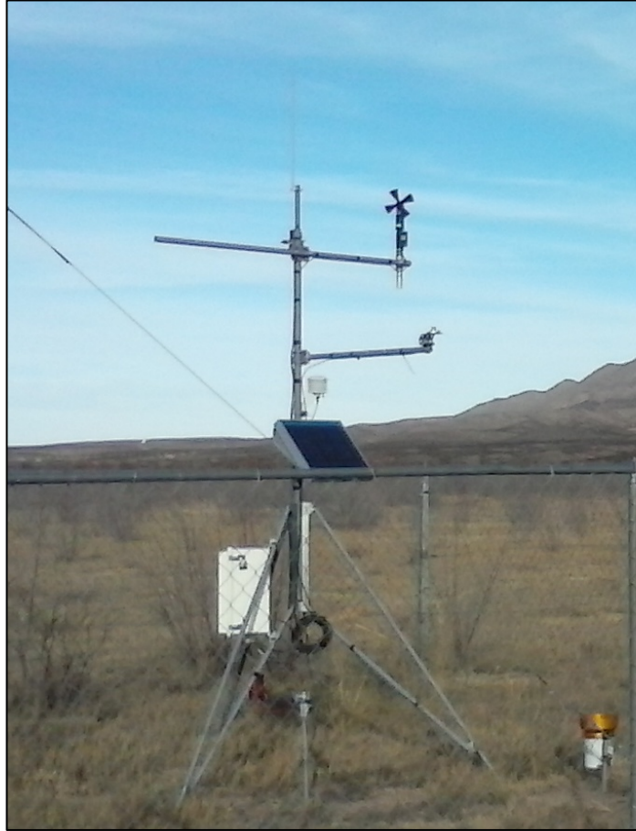
Figure 2. Saltgrass Weather Station