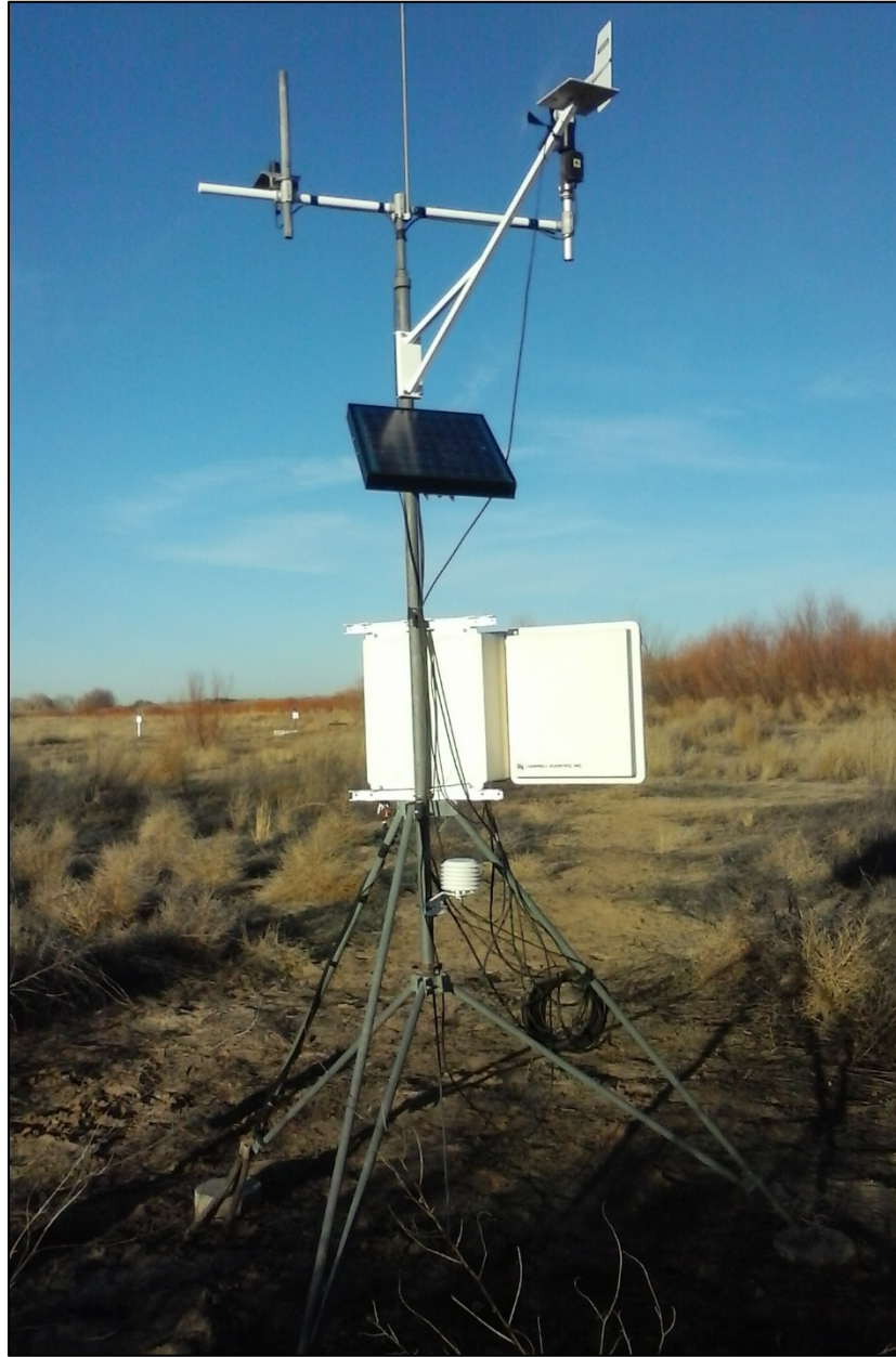
Figure 5. South Bosque Weather Station