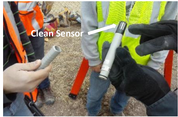
Figure 10. A Relative Humidity/Temperature sensor clogged with soil (left) and cleaned (right)