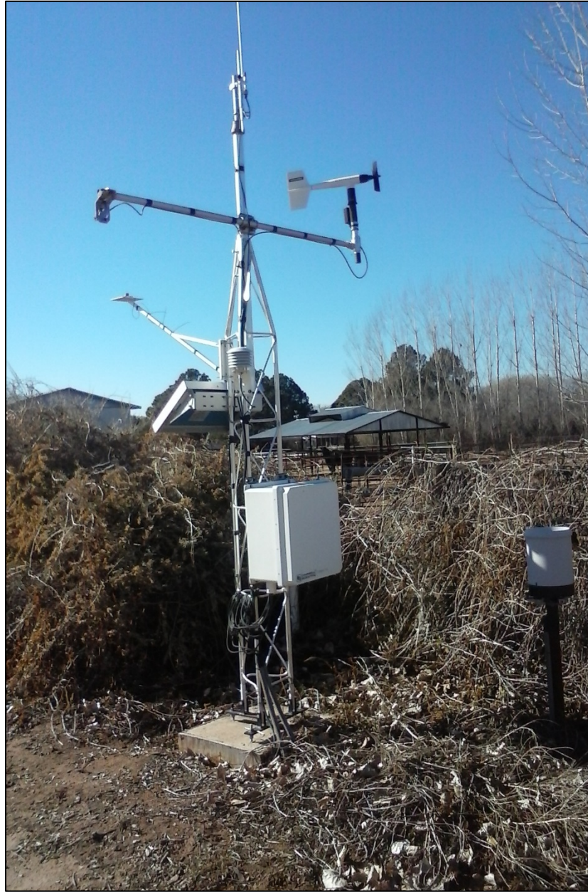
Figure 7. James Weather Station