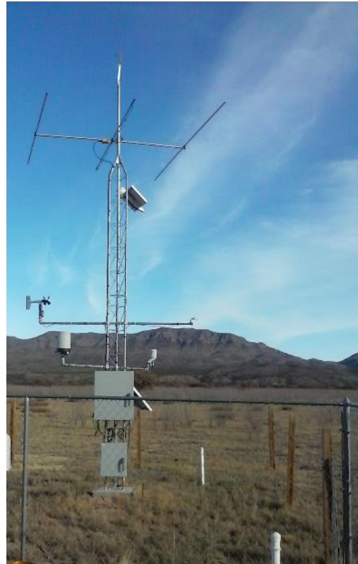
Figure 12. Nlake Weather Station (left) and Bosque Weather Station (right)