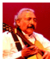
Cipriano Vigil Music of Northern New Mexico