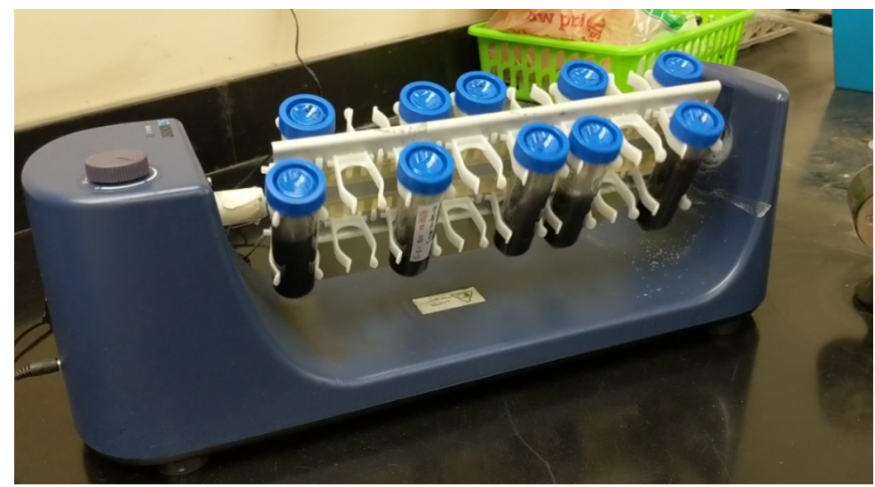
Figure 3. Batch mobility experiment procedure shown above. The image shows 50ml tubes on a rotator during the 5-hour time step of the experiment.

Blake et al., 2015). The samples were placed on a rotator (shown in Figure 3 below) for time periods of approximately 1.5 hour, 5 hour, and 24 hours, and additional aliquots were sampled at each of these time periods (Blake et al., 2020; Blake et al., 2015). The quality of all chemical analyses were checked using triplicate samples and standard reference material were used during the total-sediment chemistry and mobility experiment analyses using the ICP-OES and ICP-MS. All aliquots collected during these mobility experiments from the 6 ash samples have been analyzed using ICP-OES and ICP-MS.