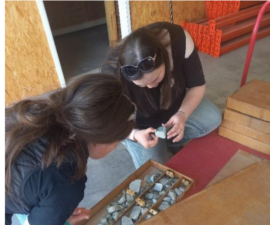
Team studying core samples (04/18/24)