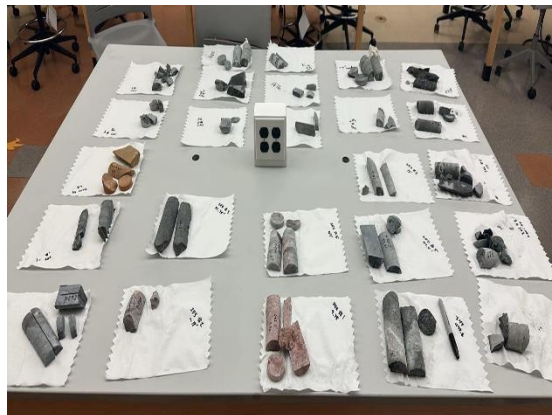
Cut, dried, and catalogued samples prior to shipment to SVL, Inc. for chemical analysis (07/30/24).