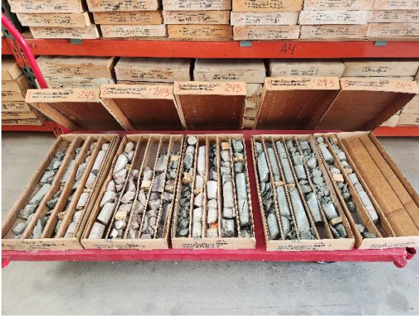
Boxes containing Jones Hill Sample 243 (50 feet) (06/13/24).