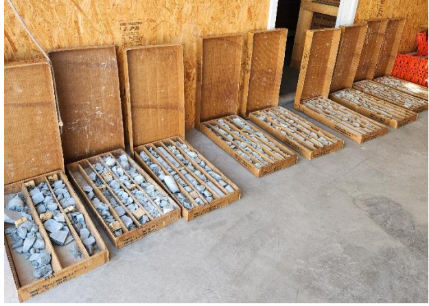
Boxes containing Jones Hill Sample 245 (10 feet) (04/18/24).