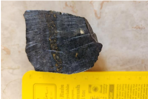
Photo of discreet cubes of pyrite and concentrated vein of Cu-sulfide minerals in rock from Jones Hill Sample 250 (06/13/24).