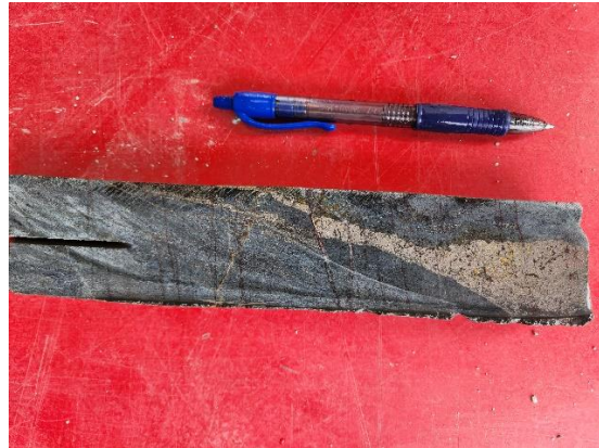
Concentrated vein of Fe-Cu sulfide minerals in rock from Jones Hill Sample 247 (04/18/24).