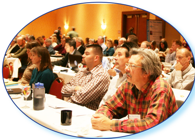
Three hundred plus people attended the 2013 Annual New Mexico Water Conference.