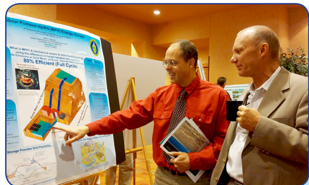
Agencies giving posters.