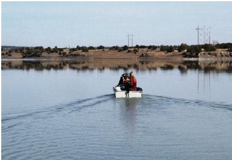
Storrie Lake is one of Las Vegas' secondary water resources.

Johns-Kaysing found that hardness, alkalinity, and conductivity values increase with decreases in elevation, while nitrate was consistently low throughout the watershed. Most