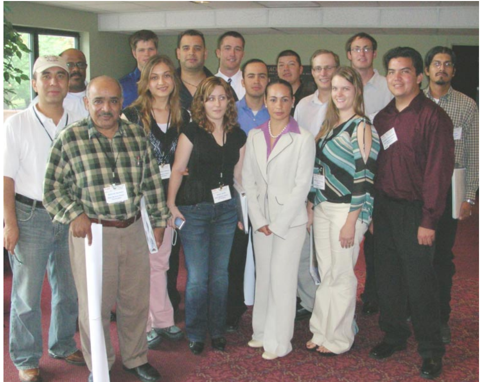
New Mexico State University's Department of Civil Engineering was well represented at the 2006 Water Research Symposium.

recipients, are available on the WRI website at: http://wri.nmsu.edu/publish/sympabs/abstracts2006.html