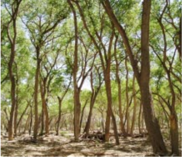
Cottonwood gallery forest in South Albuquerque. This site does not experience overbank flood events.