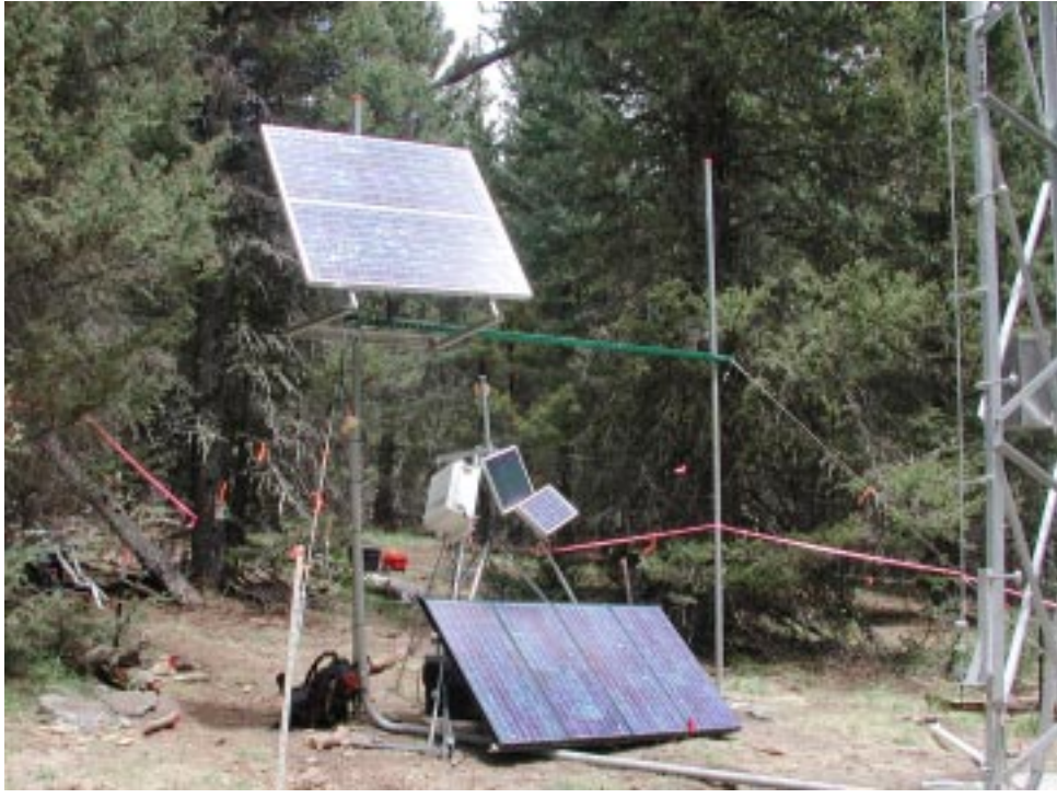
The power set-up at the Spruce Site.