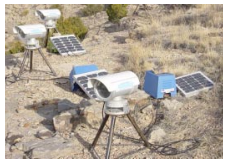
Setup of four instruments during the Scintillometer Intercomparison Study conducted by Kleissl and Hendrickx in the Sevilleta National Wildlife Refuge in Winter 2005.

The New Mexico Tech hydrologists are using scintillometers—novel scientific instruments that measure atmospheric optical disturbances over distances of up to three miles—to gauge turbulent heat fluxes at mountainous sites. Additional meteorological measurements taken, such as wind speed and direction, surface and air temperature, humidity, and barometric pressure, allow them to examine the determinants of ET in mountainous terrains, thus providing clues to improving ET algorithms there.