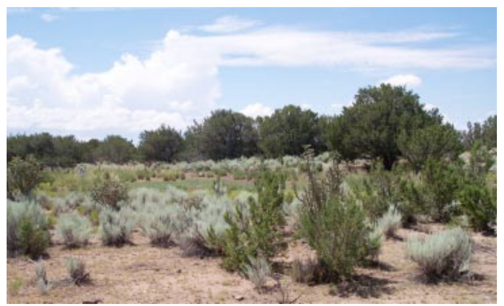
Overview of the depression being mapped with a GPS unit.

The presence of ostracodes and cattail pollen would further support that the depression stored water. Since cattails only grow in areas with permanently damp soil, the presence of cattail pollen would indicate a perennial water supply. While Murrell identified one species of ostracode and three species of gastropods within the depression, her pollen analysis results were inconclusive, and she was unable to determine the seasonality of the water storage.